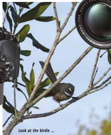
Look at the birdie ...