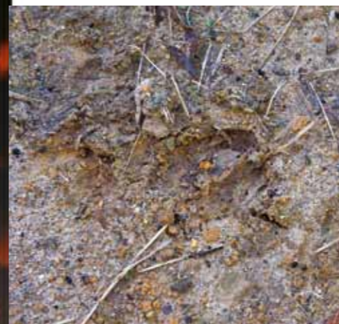
There were plenty of signs that there were deer around, they just didn't want to have their photos taken that day!