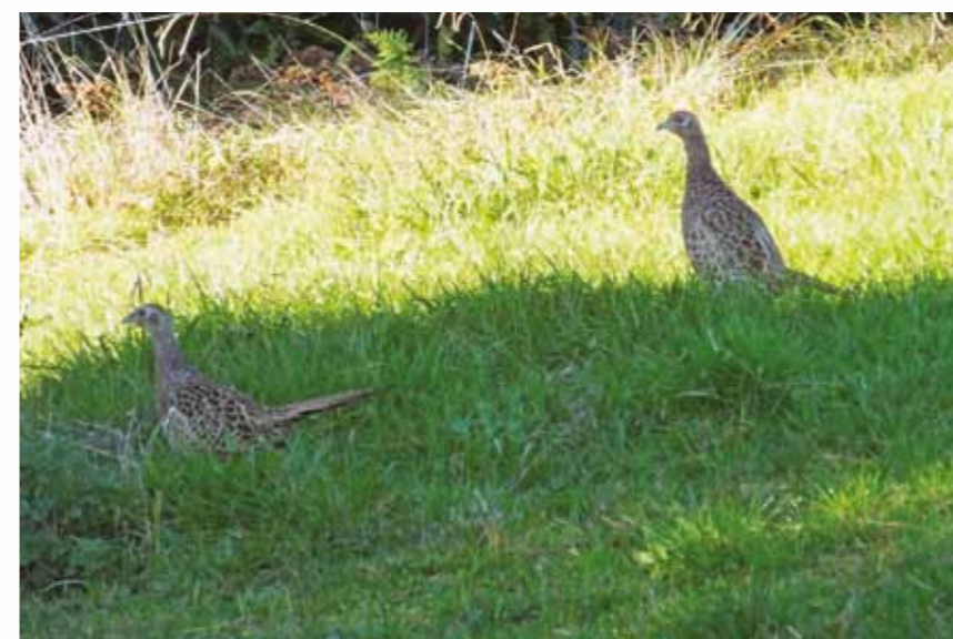
Another great example of the zoom feature. These pheasants were some distance away from us.

RRP $899 - available from all Fuji stockists.