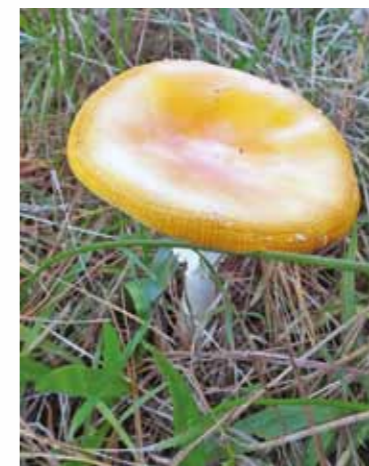
An example of the great macro capabilities of the HS50.

You will need to buy a good SD memory card and a decent bag to keep it protected - as it's not waterproof like some cameras. I would also recommend an extra battery. It promises to let you take about 600 images on one charge, but I found that with taking videos as well and leaving it on at times to get the right shot it can lose power faster. The HS50 is, above all, very easy to operate. With or without your user manual, you will be up and running shortly after opening the box.