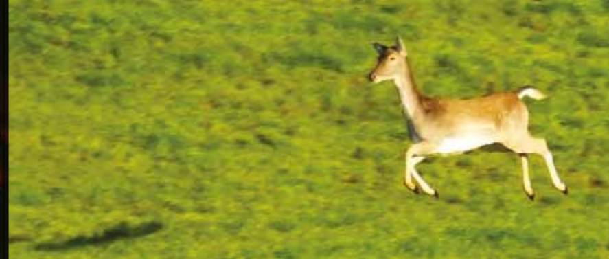
There were a few deer around - but they ran faster than I could click... I did manage to catch a few of them on the run!

The HS50 might not be the lightest camera around, but you won't have to carry any extra lenses into the bush with you or a separate video camera, as the HS50 shoots superb 1080p HD video (good enough to get frame captures from).