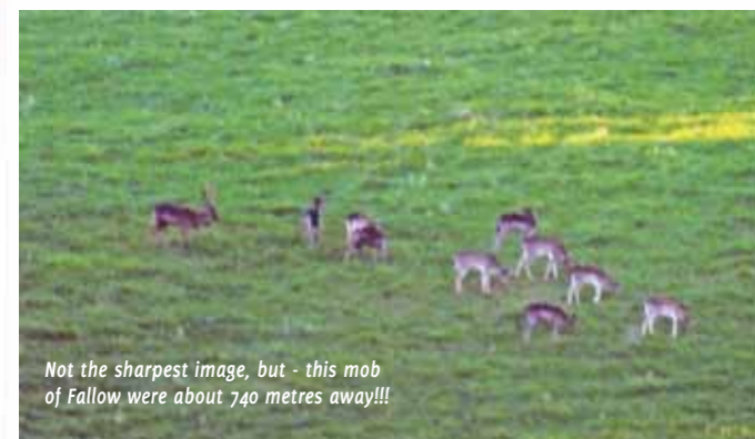
Not the sharpest image, but - this mob of Fallow were about 740 metres away!!!

This camera fits really well in my big hands - a decent size camera that actually looks and feels like a camera! Not that there's anything wrong with taking snapshots on your smartphone, but you wouldn't shoot a deer with a bb-gun would ya!