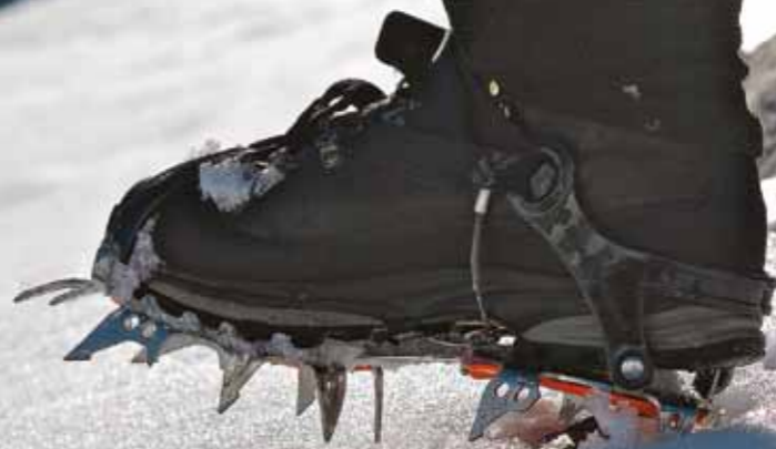
Adapting Crampons onto the boot was very easy.

valuable advice on how to take care of my new boots. Having used the advice and the grease they sold me, I was happy to see how well the boot performed. I would be walking on the Ice Plateau early in the morning before the sun had awoken, with snow and ice up along my boots and gaiters. When the sun came onto the Scarpa's it melted the snow onto the boots and gaiters, and then all slid off the boot, leaving me utterly dry along with a great performing boot. Normally the leather piece would soak up the melting snow, but this was not the case with the Scarpa's.