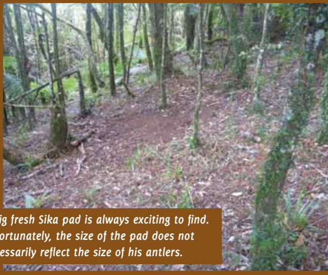
A big fresh Sika pad is always exciting to find. Unfortunately, the size of the pad does not necessarily reflect the size of his antlers.