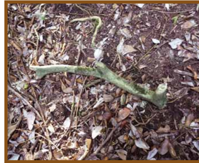
An old cast antler is perfect for the Tap-and-go method. Otherwise, just use a heavy branch.

I had just found an old cast antler and so decided to try the Tap-and-Go method - perfect thing for it.