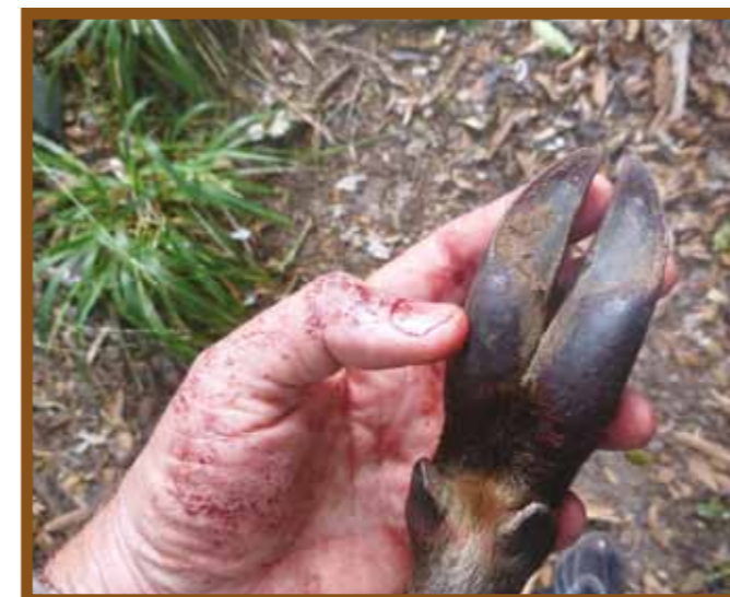
Large hoof and small antlers. The size of the hoof does not always reflect antler size as was the case with this old Sika stag.