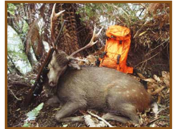
The antlers of this stag I shot in May 2010 had not grown any bigger since I last saw him four years earlier. From his jaw he was at least 10 years old.

Sika can be very curious at times, one of the reasons that they are such fun to hunt. 🐾