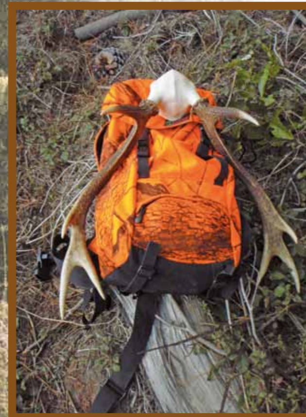
A small but solid 8-point Sika stag. Note that I have cut the skull back for the carry with my Silky saw.

I once had the same stag (a nice 6-pointer) run in on me while I was using the Tap-and-Go method for three years running! I shot at him twice when I was using my bow but still didn't get him, as he was in heavy Manuka and getting a clear shot was very tricky. He would never come in to a roar but using the Tap-and-Go method he would bolt straight in at me like a freight train, also smacking his antlers.