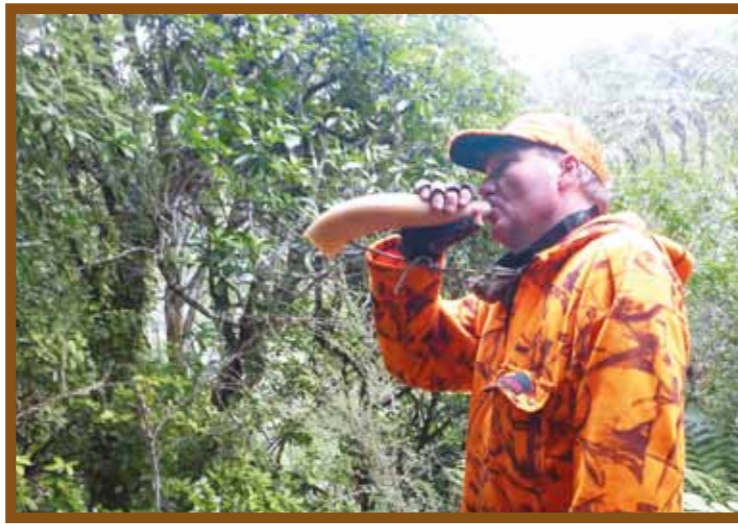
Have no fear. You can give a full volume Sika roar at very close range to a Sika stag and he will not take flight.