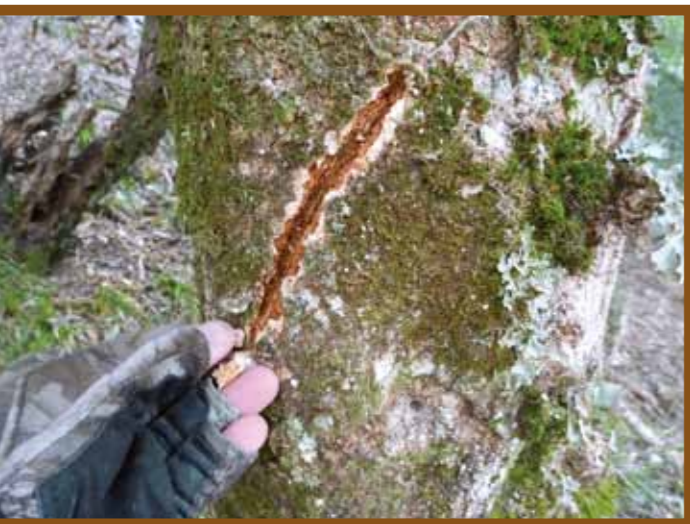
The force required for a stag to rip a gauge into the bark of a solid beech tree must be enormous. It's lucky they don't attack people (often!).

So here I was, about to have another try to nail one very cunning old Sika stag, hopefully with a nice big "hat-rack".