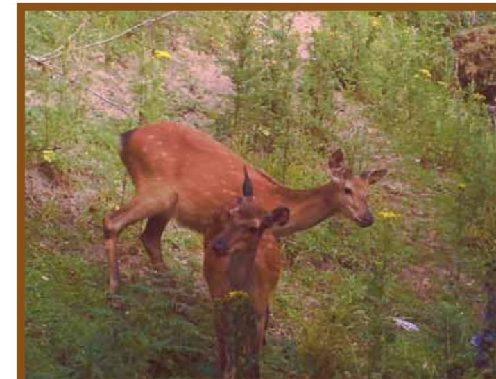
Two Sika seen here in summer coats. If you are after meat, do your bit for game management, leave the young stag (behind) and take the hind (in front).

If you want to catch up with some of my earlier articles in the Bush Hunting Series go to our website: